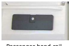
Passenger hand rail and Glove Box