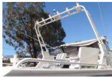
Folding Targa Bar with Rod Holders

4mm Bottom Plate (on models under 5.2m) 5mm Bottom Plate (on models 5.2m+) 6mm Bottom Plate (on models 7m+) 4mm Side Plates Level Flotation (for models under 6m) Transducer Bracket Self draining deck with x2 cast alloy scuppers 6 x welded rod holders