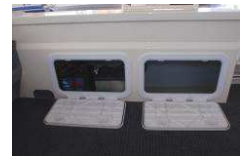
x2 Battery Storage Boxes with Hatches