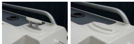
3 x Drop-down cleats (1 each side @ rear + 1 @ front)