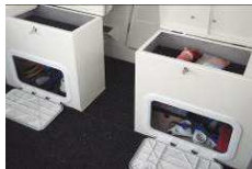
x2 seat boxes with storage

Fuel Tank: 4.8m+ = 165L | 6.1m+ = 200L | 8m+ = 300L