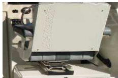
x2 Genesis seats (slide & swivel)