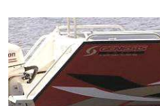
Side & Rear Rails