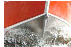
Heavy Duty Winch Point

Approximate Freeboard Heights: 4.8 – 5.0m = 630mm standard, 680mm XL 5.2 – 6.0m = 650mm standard, 700mm XL 6.1m+ = 800mm XL sides standard Hardtop = 875mm