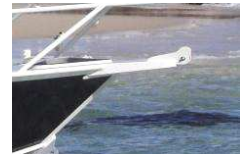
Single Bow Roller 6.1m+ = Double