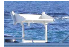
Removable Bait Board with x2 Rod Holders

4mm Bottom Plate (on models under 5.2m) 5mm Bottom Plate (on models 5.2m+) 6mm Bottom Plate (on models 7m+) 4mm Side Plates Level Flotation (for models under 6m) Transducer Bracket Self draining deck with x2 cast alloy scuppers 6 x welded rod holders